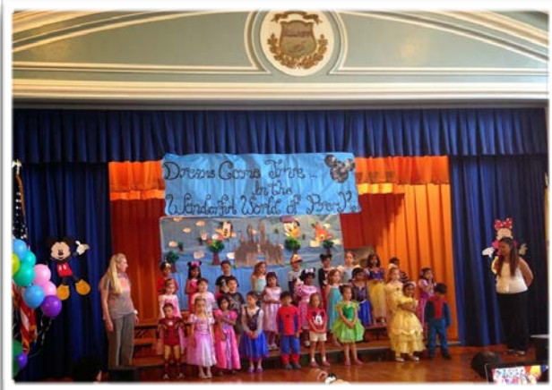
Generations: Pre-K4's Disney-themed magical ceremony (above) and 5th Graders' Moving On Ceremony (below), where students received honors and scholarship awards for academic achievement and outstanding character.