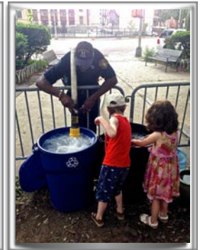
Keeping the garden hydrated during the hot summer months